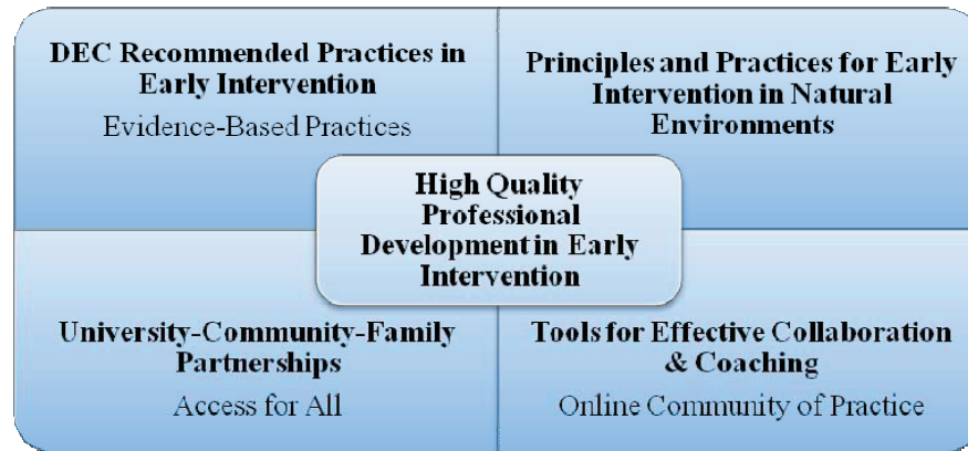
Figure 1. Foundation for High Quality EI Services